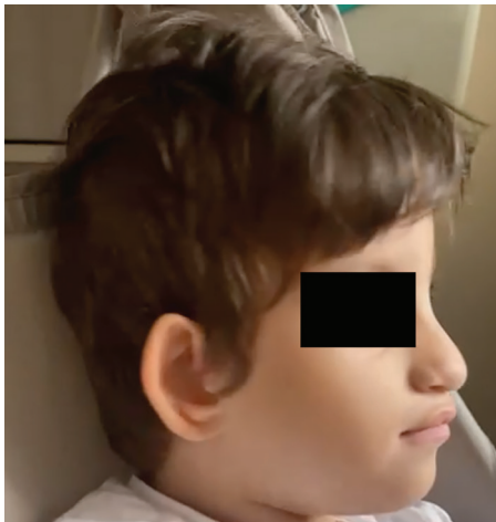
Figure 1: Physical examination from side

Although there is no obstacle in induction with inhalation, there is a risk of aspiration because gastroesophageal reflux may occur in this patient group (12).