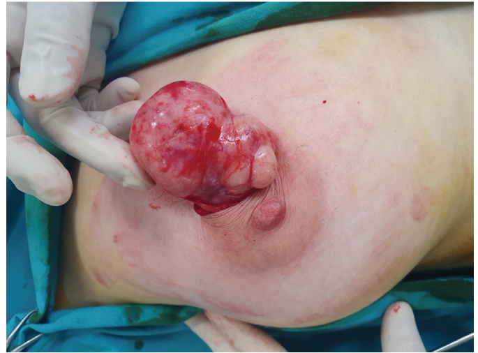
Figure 1: Image of a giant fibroadenoma removed from the incision made from the areola line

Statistical analysis of the study was performed using SPSS 20 (SPSS for Windows, Inc., Chicago, IL, USA). Data were presented