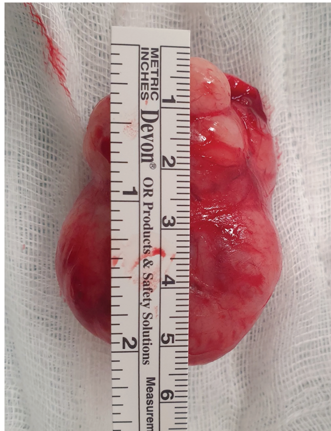
Figure 2: Measurement of the size of a giant fibroadenoma