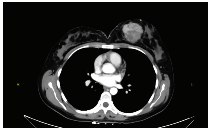
Figure 4: A giant fibroadenoma image on thorax tomography taken due to respiratory distress