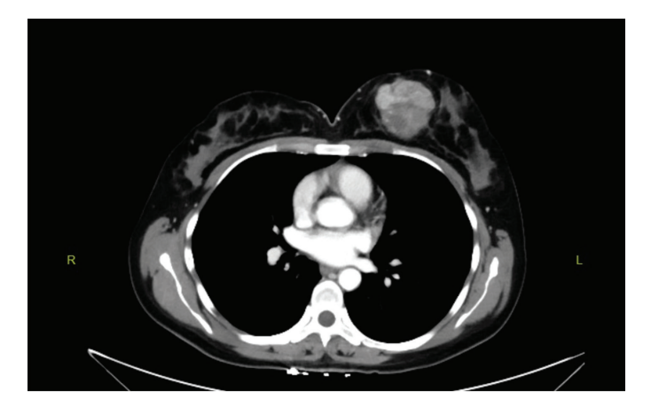
Figure 4: A giant fibroadenoma image on thorax tomography taken due to respiratory distress