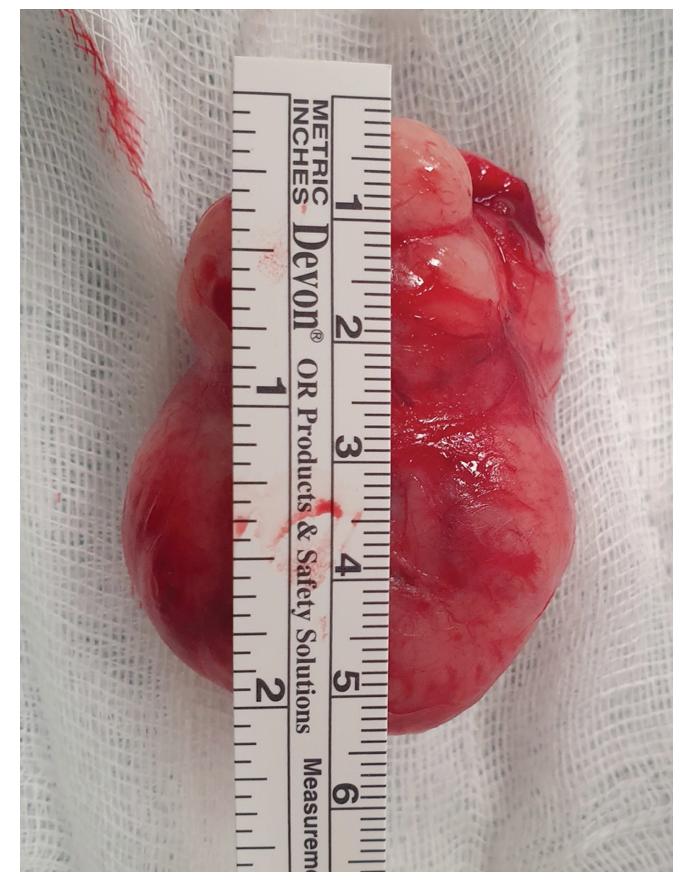
Figure 2: Measurement of the size of a giant fibroadenoma