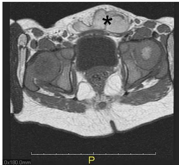
Figure 1: Magnetic resonance imaging scans showing the mass with asteriks

Although lipoblastoma is a rare entity in inguinal masses, it is important to consider them in the differential diagnosis of a prepubertal child with inguinal mass. Complete surgical excision is important to prevent recurrence and a minimum two years of follow-up is recommended in these patients. Recently, karyotype analyses have also been used in the differential diagnosis of lipoblastomas and liposarcomas.