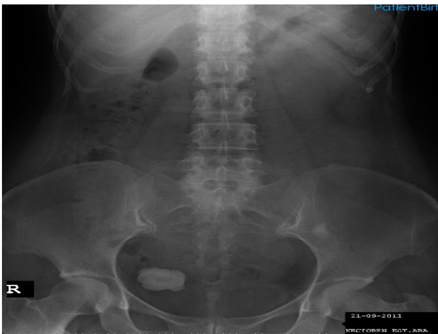
Figure 1 : A giant stone formation in bladder.

In the first control at postoperatively second month, 24-hour urine parameters and blood parathormone levels were analyzed and all were found to be normal. The follow-up period was 18 months and patient was seen on every 6 th month. At each visit, urinalysis, serum creatinine analysis, plain film and abdominal ultrasonography were performed. No urinary tract infection or new stone formation was seen in this period.