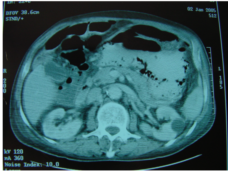
Figure 3: Mesenteric region dirtiness at the posterior wall of the fundus.