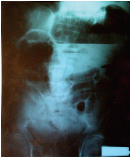
Figure 2: A large amount free air under the diaphragm on plain abdominal radiography.